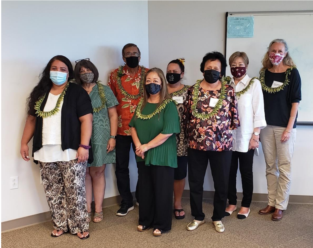
Above – New Committee on Aging Members